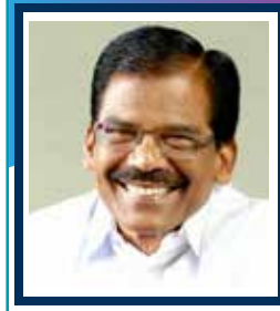
CA. Thomas Chazhikadan Hon'ble Member of Parliament Kottayam