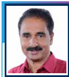
Shri. N. K. Premachandran Hon'ble Member of Parliament Kollam