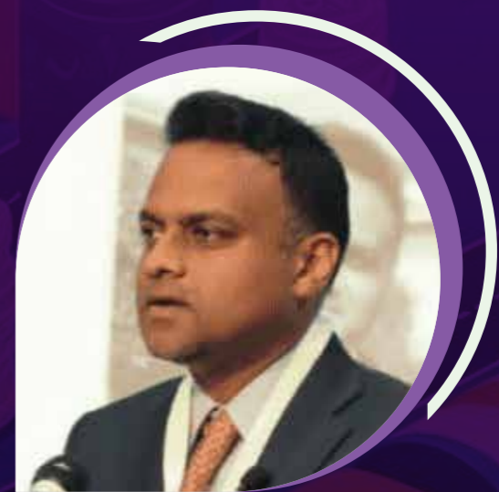
Chief Guest Adv. Haris Beeran Hon'ble Member of Parliament, Rajya Sabha